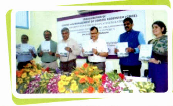
Release of Booklet of LEED criteria & Report Cards on assessment of Paradeep & Dhamra Coast