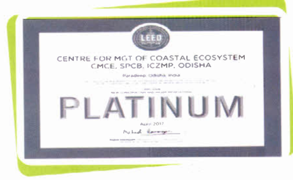
LEED Platinum Rating Certificate handed over to Chairman, OSPCB by USGBC Representative