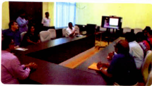
Visit of World Bank Mission