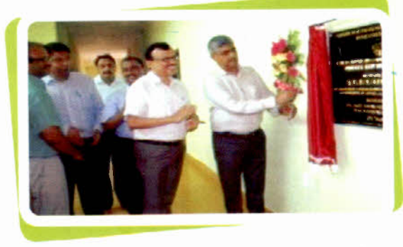
Inauguration of CMCE Building at Paradeep