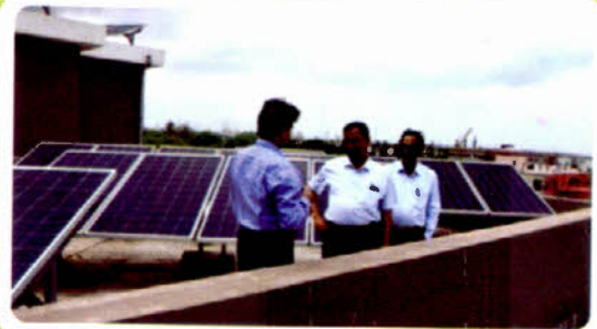
Visit of SICOM, New Delhi