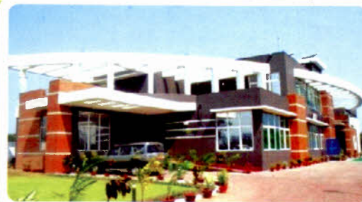
Centre for Management of Coastal Ecosystem (CMCE) building of OSPCB at PARADEEP