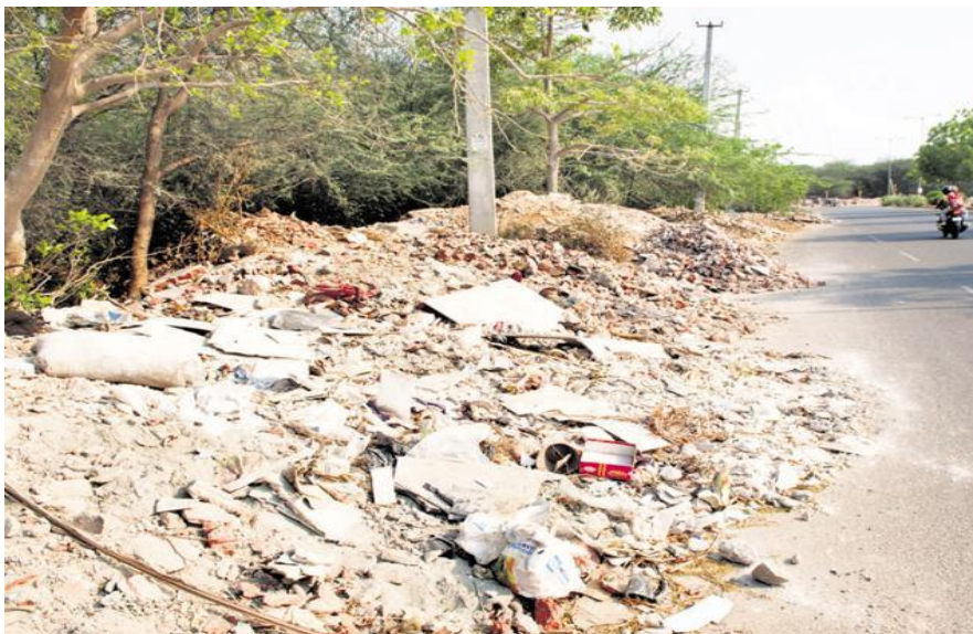
Figure 1.1: Indiscriminate dumping of C & D wastes along roadsides

The guidelines recommends pollution mitigation measures in operation of C & D dump sites / waste processing facilities. Though guidelines focus mainly on facilities generating more than 20 tons or more in one day or 300 tons per project in a month of installed capacity (bulk generators) in cities / towns however, the mitigation measures suggested can be scaled after consultation with the concerned department in the state government. The reference to 'operators' in these Guidelines imply operators of bulk C & D waste management / waste recycling / processing facilities.