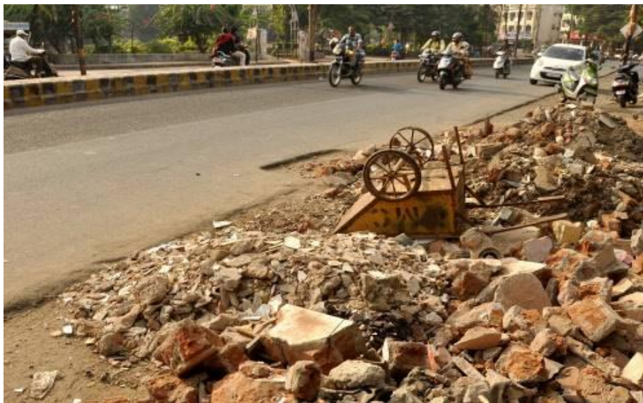
Figure 2.1: Indiscriminate dumping of C & D wastes along roadsides