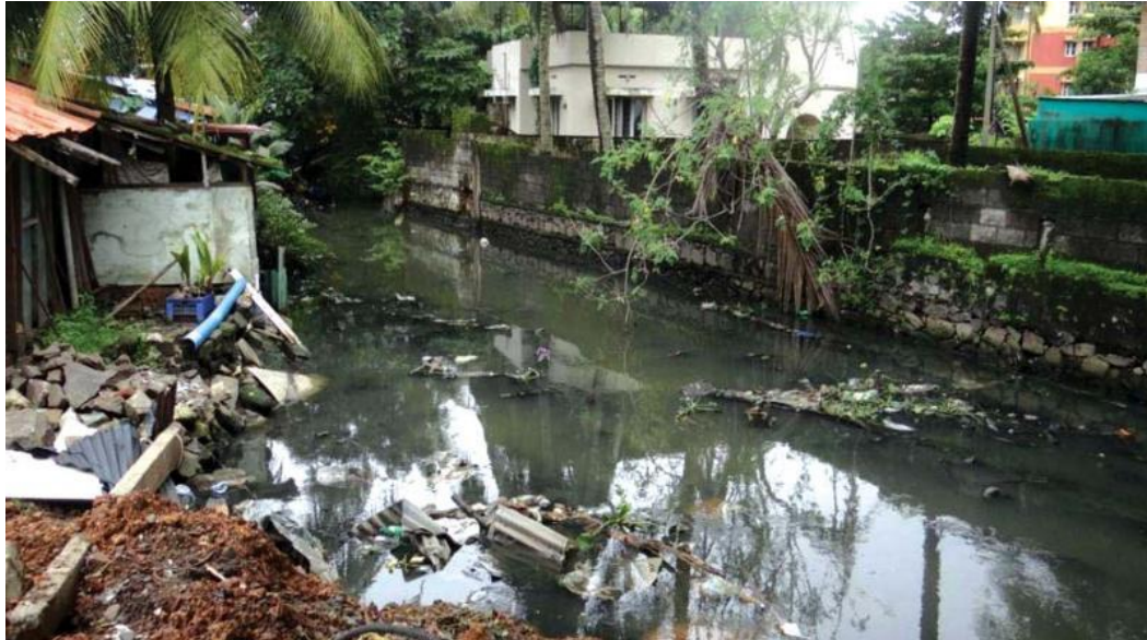
Figure 7.1: Dumping of C & D wastes near drains in cities