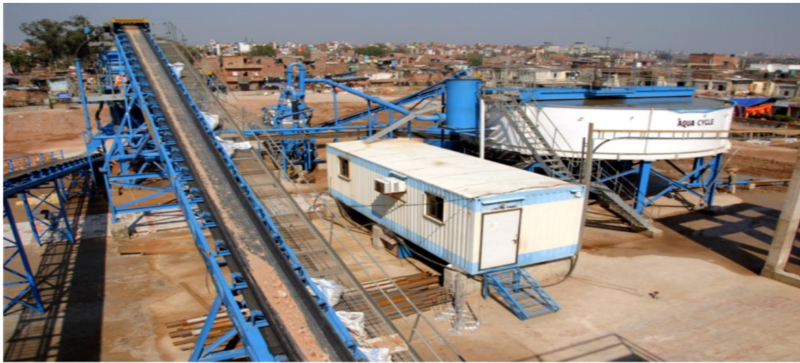
Crushing units at Burari C&D waste recycling plant