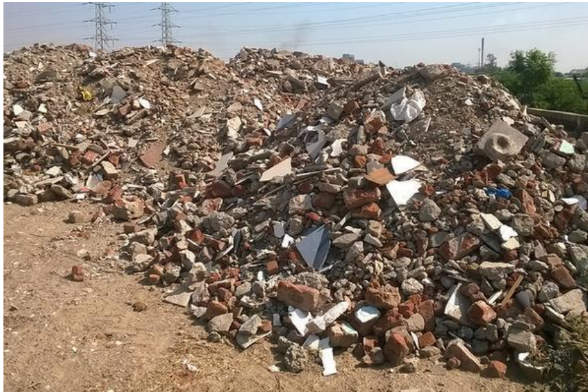
Figure 9.1: Loss of C & D wastes “loss of opportunities to reuse / recycle