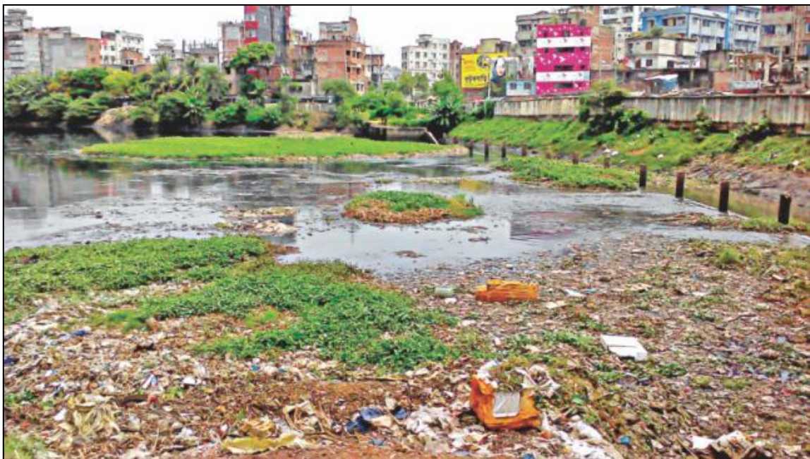
Figure 8.1: Continuous dumping of C & D wastes chokes city ponds / lakes