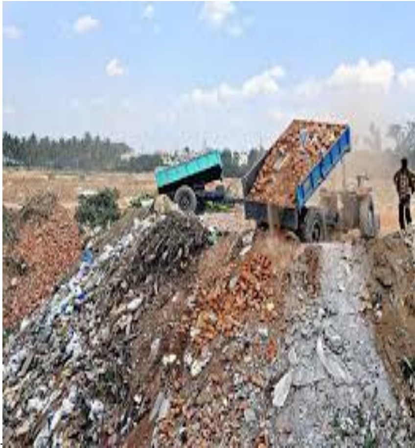
Figure 5.1: Loss of C & D wastes - can be processed for reuse / recycle