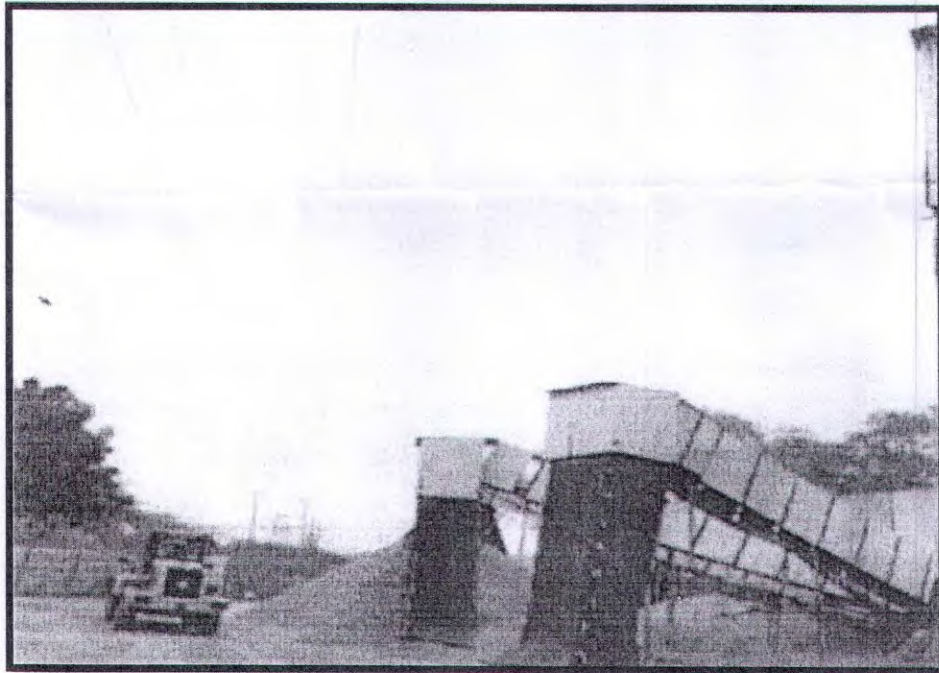
Figure-2(a): Chute from top of discharge point